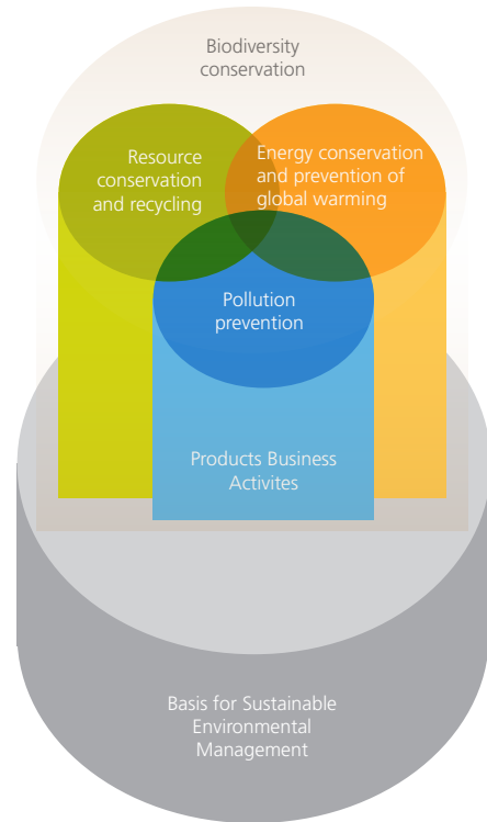
4 pillars of Ricoh's environmental management